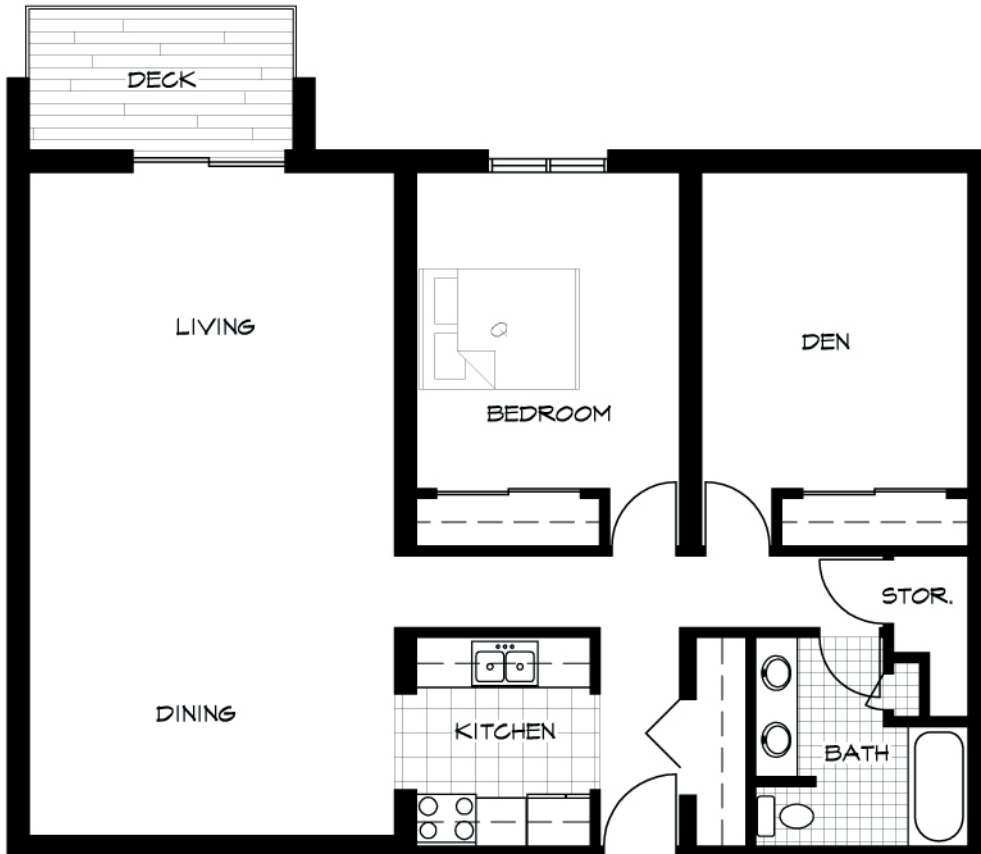
FLOOR PLAN - TYPICAL 1 BEDROOM + DEN