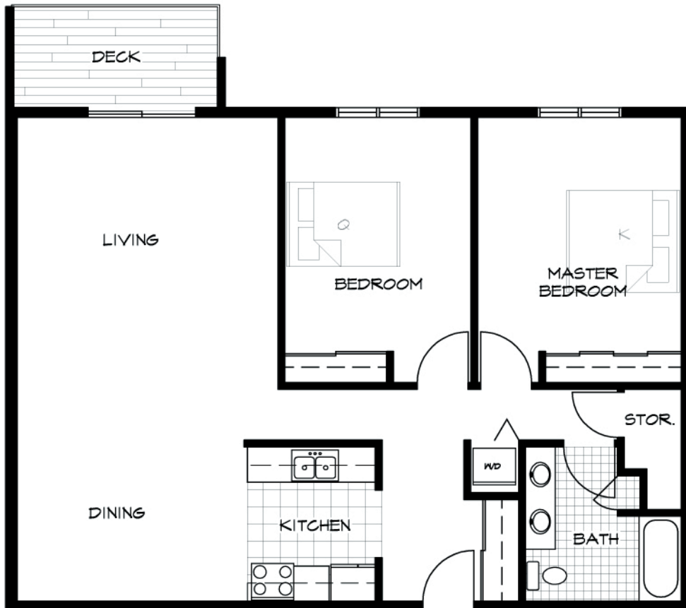
FLOOR PLAN - TYPICAL 2 BEDROOM - A